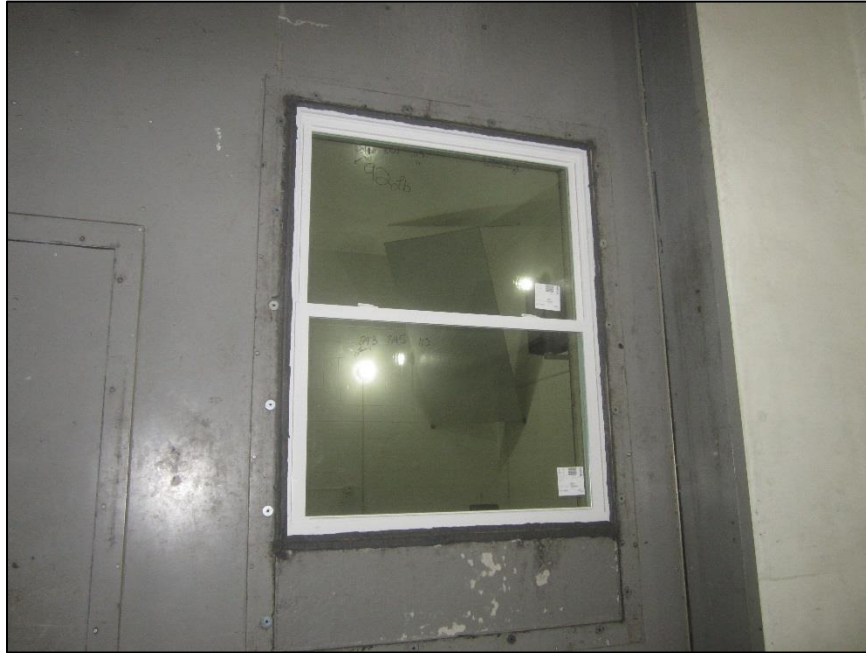
Receive Room View of Installed Specimen